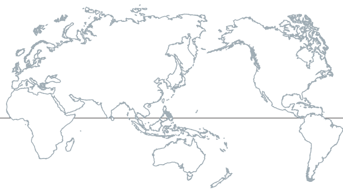
Figure 1. Student mobility in tertiary education, by ISCED level (2013) International or foreign student enrolments as a percentage of total tertiary education