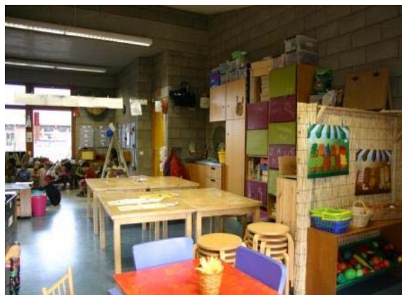
Freinetschool 'De Levensboom', Marke

The school building is expected to fulfil its purpose by supporting the school activities for which it was designed. Through its spatial organisation, the building embodies an educational vision and pedagogical project that is implemented on a daily basis. In addition, school buildings need to provide a reassuring, stimulating, secure, safe and healthy working and learning environment, where both students and teachers can feel comfortable and motivated. The social role of school buildings can also be interpreted from a broader perspective as mirroring the society that created them (Box 5).