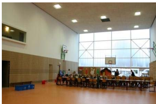
Gymnasium, ‘De Twijg’ Primary School, Wiermaal

Context A. The school building. Discourse on buildings is equally applicable to discourse on school buildings: all buildings are the product of the social actions of various relevant actors (architects, government officials, planners, departments, school boards, students, teachers, etc.), who can shape the planning and design of a building and (re)interpret the building during occupancy. School buildings will exert a stabilising and supportive but nondeterminant influence on learning and teaching and hence contribute to the reproduction and/or innovation of the educational system. They are no absolute ‘spaces’ that simply ‘contain’ educational activities, but as ‘places’ they are in a constant and dynamic relationship with all human activity going on in the building. Policy related to school buildings can facilitate or hinder the work of school leaders, planners and designers, although these “knowledgeable actors” have a certain degree of