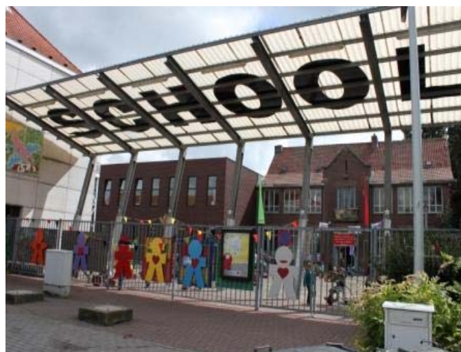
‘De Letterdoos’ Primary School, Oostakker

Two different bodies are responsible for implementing school building policy in Flanders (see Table 2).