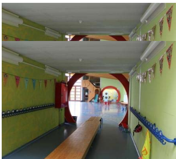
Dijkstijn Primary School, Sint-Katelijne-Waver

Using the concept of space in Giddens' (1984) structuration theory, Gieryn (2002) considers buildings as the spatial media between "agency" and "structure". 1 According to structuration theory, space is more than an "environment" for social interaction. Space needs to be interpreted as a resource enabling social actors to interact with each other, thus contributing to the (re)production of society as a whole (Giddens, 1984; Meert, 2000). In this respect, buildings also help to give structure and stability to our daily lives. But they do not serve this purpose perfectly: buildings are demolished, can serve a new purpose or are repeatedly renovated and reinterpreted. Buildings thus have a "dual" quality: they provide stability and structure in our social life and reproduce social structures because of their physical qualities; and they are an instrument that can be moulded and interpreted by "knowledgeable individuals" (Gieryn, 2002).