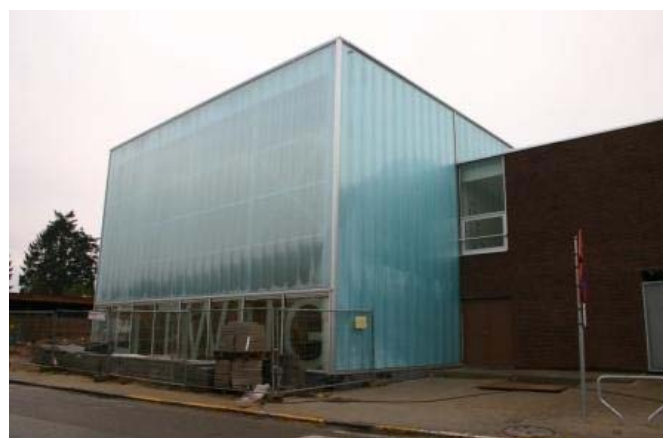
Gym exterior, 'De Twijg' Primary School, Wijgmaal

The realisation of a school building project is not a linear process resulting in a single “optimal” solution. The process of planning, designing and building a school is shaped by the interests and interactions between contractors, government officials, architects, school boards, directors, teachers, students and others. It is in the government's interest to gain an insight into the challenges facing all of these groups at each stage of the process. The government is therefore responsible for developing the right policy to benefit each one of these partners, for example, by providing financial support, guidelines, examples of good practices and assistance to developers and builders about good project definitions, by developing evaluation instruments for the benefit of the user population, by playing a role in user participation; or by facilitating collaboration between the various parties involved. (Box 2).