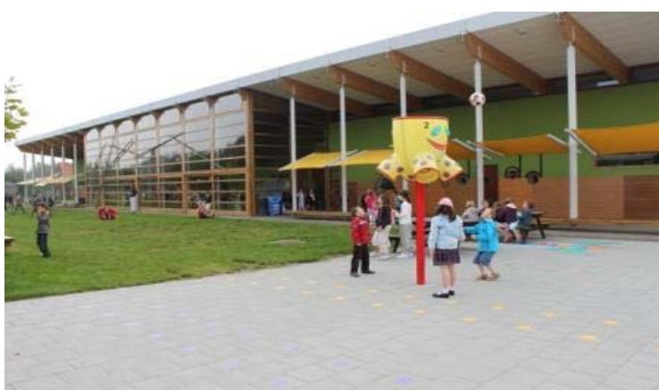
‘Dijkstijn’ Primary School, Sint-Katelijne-Waver, a warm and welcoming school

The completion of a school building project signifies the start of the school building’s lifecycle, raising questions for school building policy about its daily management, utilisation, maintenance and performance (Box 4). Because school buildings are subject to the (re)interpretation of users, they are invariably seen as learning buildings , capable of adapting to new situations and being the subjects and objects of spatial reinterpretations and physical adjustments. But when the structural-physical properties of