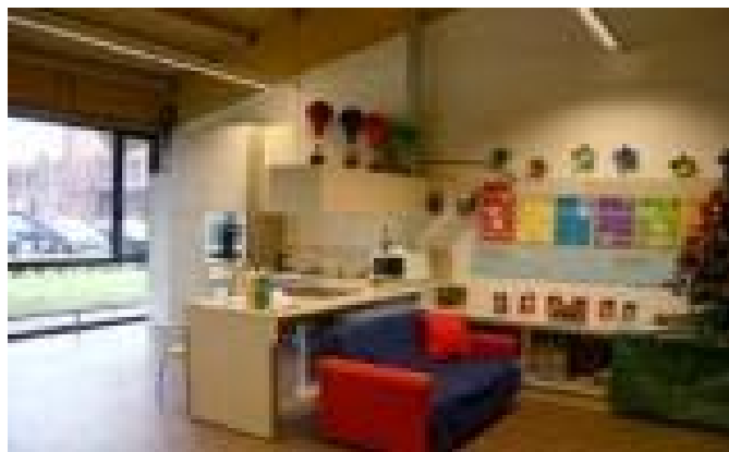
‘Sint- Gerardus’, school for students with special education needs, Diepenbeek

Changes in technology, demography, the environment and service delivery are shaping both policy objectives and instruments with regard to school buildings policy. Growing student-aged populations demand adequate school building capacity to accommodate all pupils. The need to equip students for the information age has necessitated proper integration of ICT infrastructure in school buildings. Increased concern about the environment and climate change has also introduced its own set of new requirements for sustainable buildings. The increasing demand for multifunctional accommodation has led to co-operation with other sectors, such as childcare, social services, culture and sports. (Box 3).