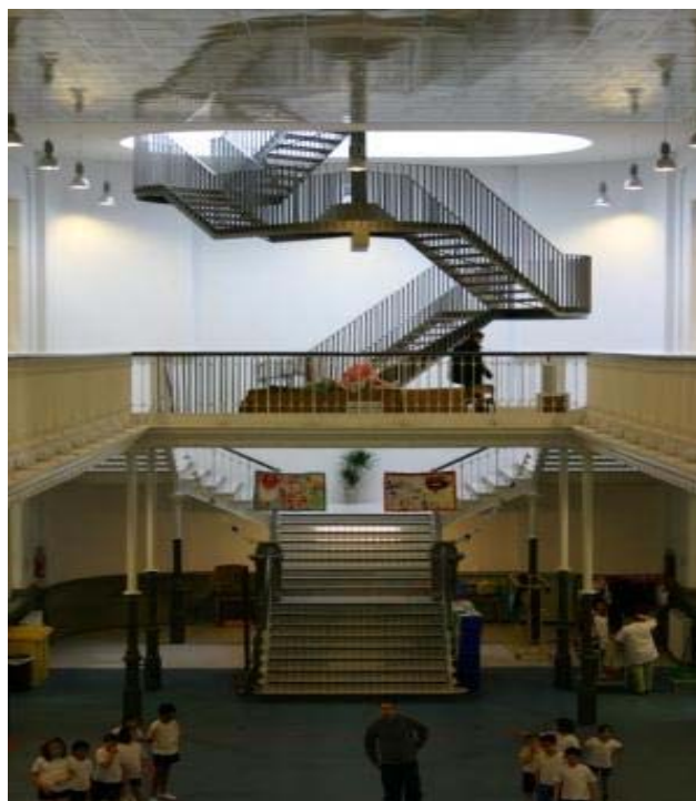
Sint-Joost- Aan-Zee Primary School, Brussels.

The interaction between education and society takes place in an open system consisting of multiple layers. The cluster “student-classroom-school” can be seen as the smallest organisational unit that operates within broader local associations of co-operative education units or school communities. One layer above, in local and central (education) policy, policy making runs bottom-up from the schools to the central policy level, while policy implementation runs top-down from the central policy level to the schools. Depending on the context, a range of different stakeholder groups and