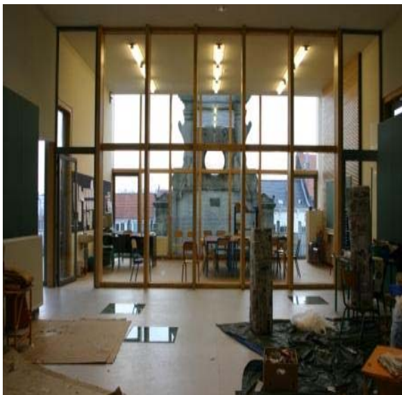
‘Sint-Joost-Aan-Zee’ Primary School, Brussels, a quality learning environment for a popular inner-city neighbourhood.

Schools and authorities are not the only actors in school construction policy. Representative organisations in education have an important responsibility to defend the interests of schools and to support them. The influence of these groups on school construction policy should not be underestimated, and governments must try to engage in a permanent dialogue with them. Other stakeholder groups such as unions and teacher-parent associations can also play a significant role in developing and implementing school construction policy. (Box 8).